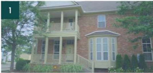
End unit condo