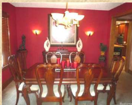
Dining Room: 15x14

Gourmet kitchen with cherry cabinets and high-end stainless steel appliances.