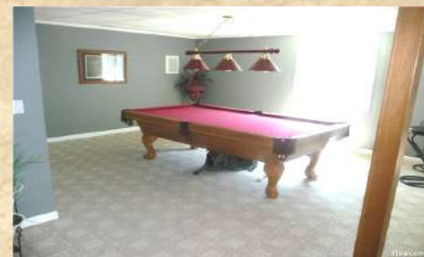
Finished Walk-Out Basement

*To learn more about our Purchase-Lease Program, visit our website below.