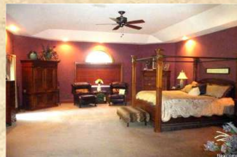
Master Suite: 26x23