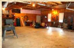
Heated Workshop: 47x34