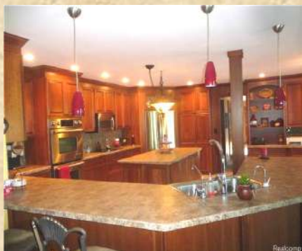
Gourmet Kitchen: 20x15