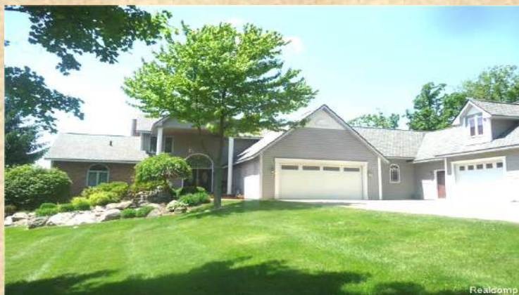
4540 DANBI Drive, Metamora Twp 48455-9762

VERY AFFORDABLE- INCLUDES 25% RENT REBATE AT CLOSING