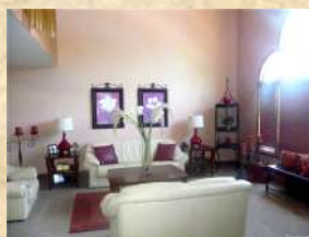
Living Room: 21x20